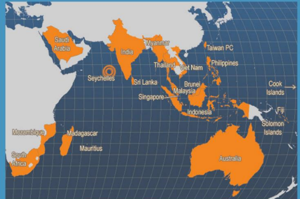
Geographical distribution of Penaeus monodon